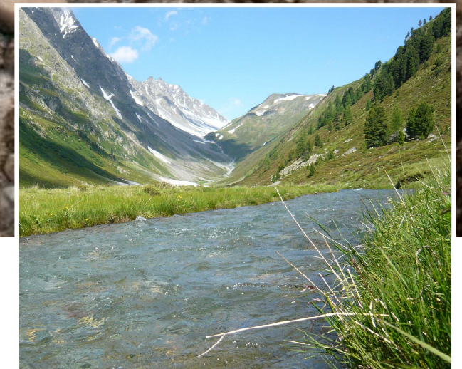
NP Hohe Tauern/A