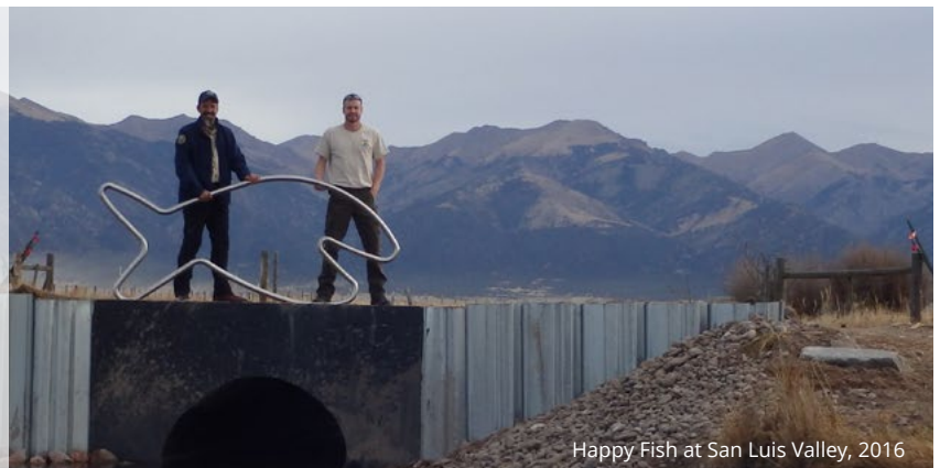
Happy Fish at San Luis Valley, 2016

In 2018, the Happy Fish symbol will also travel to our partner "The Museo Nacional de Historia Natural" in Bolivia!