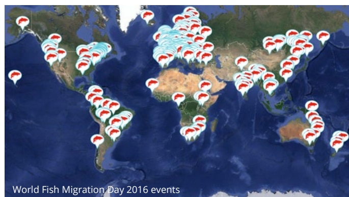
World Fish Migration Day 2016 events

activities: field trips, events at a school or aquaria, the opening of fishways, races, food festivals, etc. At this local level, the logo and central message of the World Fish Migration Day, Connecting fish, rivers and people , will be used to connect sites around the world. The day will start in New Zealand and will follow the sun around the world, ending in Hawaii.