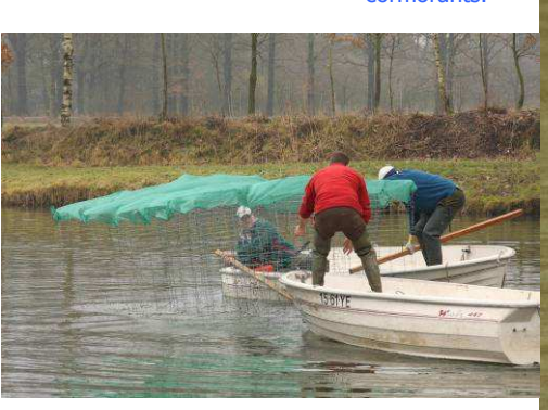
Wire mesh cages are placed to create artificial hiding places for fish.