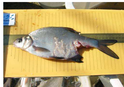
Fish that are too large to be eaten by cormorants, are sometimes severely wounded

EAA is sure that this can be achieved, when the EU Commission establishes an adequate forum, where all relevant stakeholders are adequately represented and can bring in their arguments, and where these arguments are discussed and evaluated on basis of scientifically sound and rational criteria. However, no satisfactory solution is possible if — as has happened in the past — the legitimate concerns and solidly founded arguments of the European angling community are simply neglected.