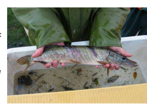
Many pike that are caught during research fisheries show tell tale wounds inflicted by cormorants.