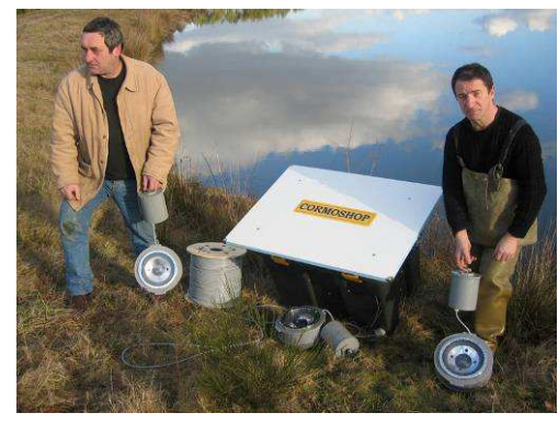
Even installations that produce the sounds of orca whales are used to scare away cormorants temporarily.