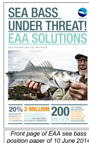
Front page of EAA sea bass position paper of 10 June 2014