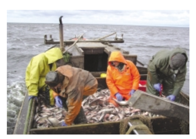
Commercial fishing in Lake Peipus, Estonia

salmon fishing in all rivers and river mouths with wild salmon stocks. These Resolutions were passed because of the need to stop further degradation of wild salmon stocks and to rebuild the population of wild salmon in the Baltic Sea. These two resolutions paved the way for the development and adoption of the Baltic Salmon Action Plan during the IBFSC's Extraordinary