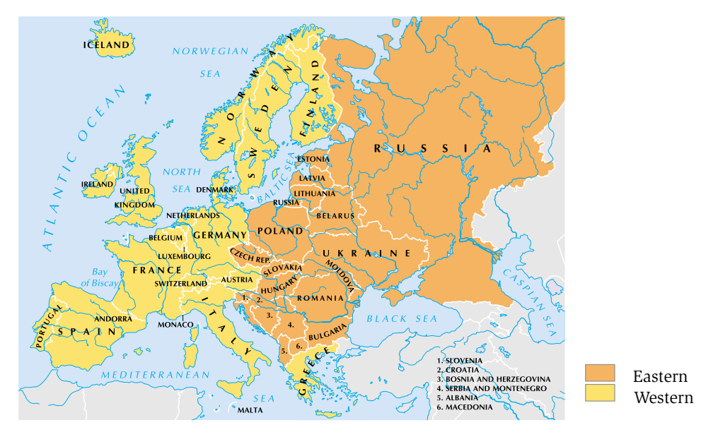
Figure AIII 1. EIFAC regions of Europe

EIFAC at its 22<sup>nd</sup> Session in Windermere, United Kingdom, 12–19 June 2002 compiled the comprehensive freshwater fishery catches and aquaculture production statistics for 1990–2000. EIFAC statistics is widely used by researchers, planners and policy makers.