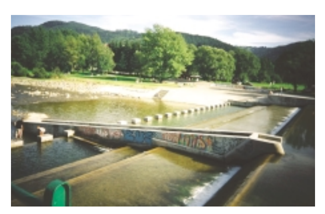
Fish ladder in the Beskidy Mountains, Poland

protection, safeguarding and conservation, mentioning genetic diversity, the need to minimize fisheries impact on biodiversity and to develop research about fishing gear impact. FAO Technical Guidelines on responsible inland fisheries (FAO, 1977) is also considered as valuable reference source for fisheries managers worldwide (see Annex IV).